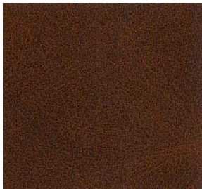
dark brown 805